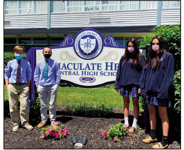
Enrollment at Immaculate Heart Central has grown this year, partly due to the school's ability to maintain in-person education five days per week last year.

Toward that goal of staying open, Paskill said IHC, like other schools, will be requiring all students, teachers and staff to wear face coverings. Three feet of distance will be maintained between students in the classroom, and that distance will increase to six feet when students are eating. The school will also continue monitoring temperatures, conducting extra cleaning protocols