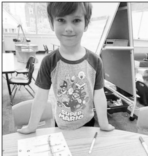
Students at St. Agnes School in Lake Placid will return to their classrooms for the first day of instruction on Sept. 7.

We are proud that our students embrace gospel values and practice acts of kindness, and we are grateful that our families entrust us with their children’s preschool and primary school education.”